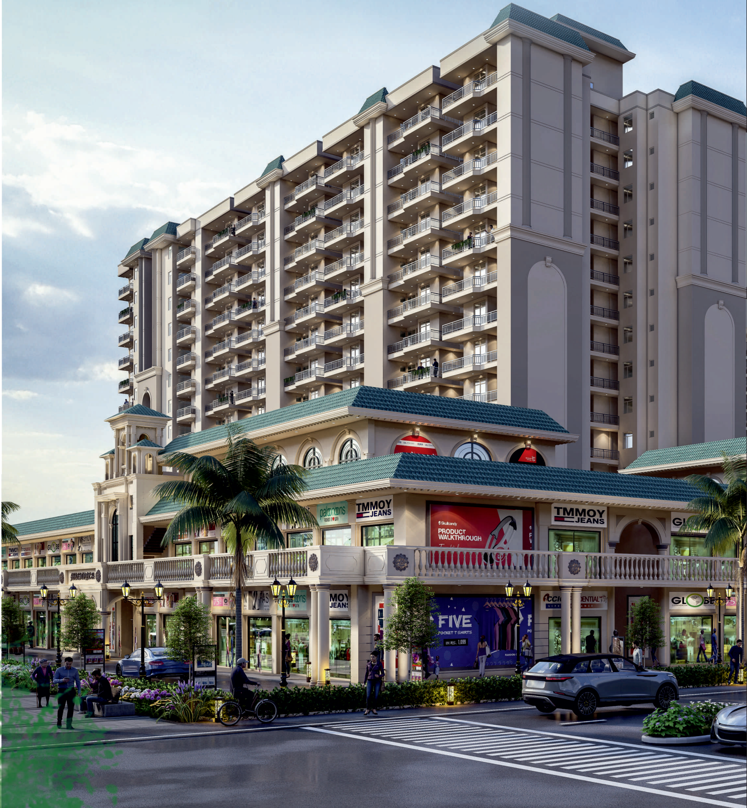
*Perspective view may vary